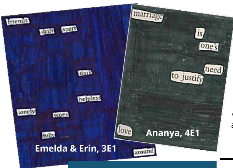
Emelda & Erin, 3E1

During English lessons, students got to vote at the canteen where the captions were displayed. This activity allowed students from all levels to unveil their creativity in creating captions. The winning captions were "relatable" and "humorous" to students.